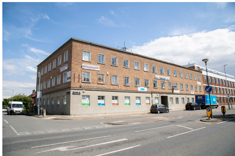
The view from the road.