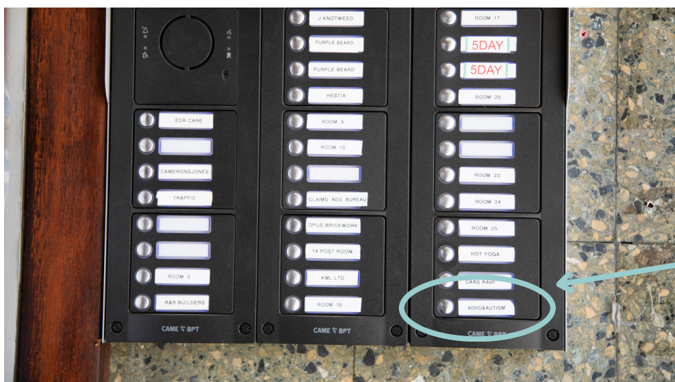
CAAS Centre buzzer

There are a set of buzzers on the right wall next to the door. The buzzers look like this; the CAAS Centre buzzer is the last and looks like this: