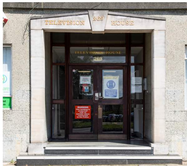
The building's front door.