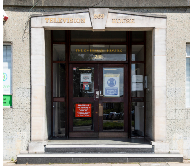
The building's front door