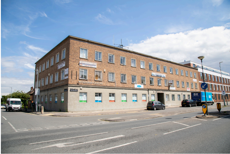
The view from the road.